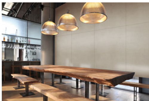
Wall cladding in the catering trade with LightBeton „Authentic”