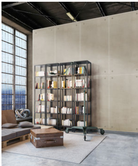
LightBeton „Formwork” - wall design with bolting holes

Richter akustik & design GmbH & Co. KG St.-Annener-Straße117 49326 Melle / Germany Telefon: +49 (0) 5428 9420-0 Telefax: +49 (0) 5428 9420-45 info@richter-akustik-design.de www.richter-akustik-design.de