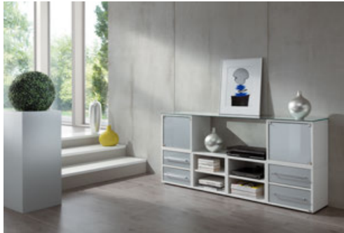
LightBeton as wall cladding in the „Classic grey” version

LightBeton® in use: ideally suited as ceiling and wall panels