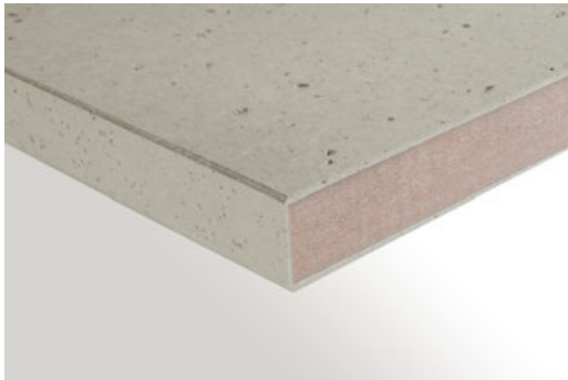
LightBeton ® : cross section / edge

Richter akustik & design GmbH & Co. KG St.-Annener-Straße117 49326 Melle / Germany Telefon: +49 (0) 5428 9420-0 Telefax: +49 (0) 5428 9420-45 info@richter-akustik-design.de www.richter-akustik-design.de