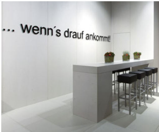
LightBeton in trade fair construction