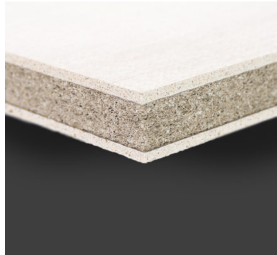
Cross-section of a RiBoard® untreated board with covering layers