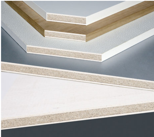
Individual design options