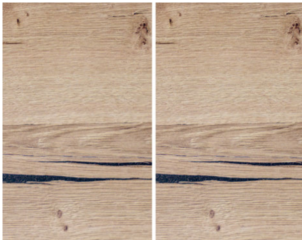
Wood sample (left) and faithful reproduction