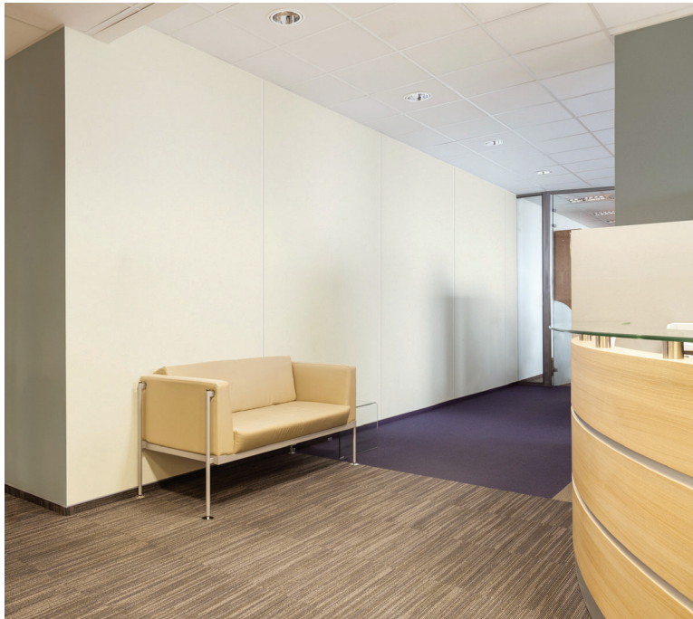
Design example MineralVeneer in two colour shades

MineralVeneer is available in a variety of standard colours and sizes. With a minimum order quantity of 500 m 2 individual colour adjustments are available. The dyed-through sheets are available in the size 3.050 x 1.250 mm.