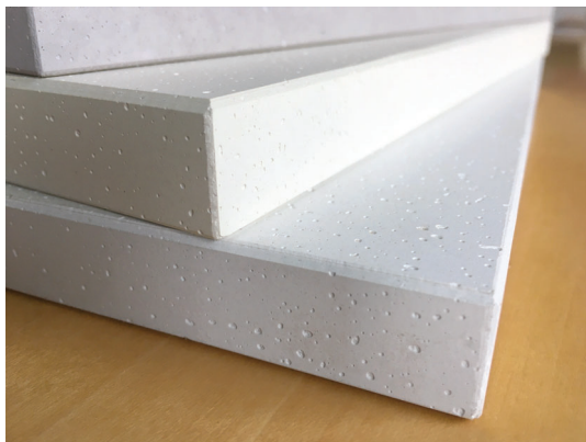
Panel with colour matching edgebanding